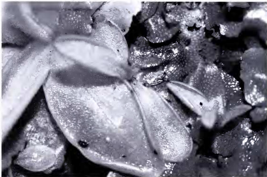
Figure 6. Seedlings of P. crystallina subsp. hirtiflora germinating in the Botanical Garden of Calabria University.

Joly, S., Zunino, F., Partrat, E. 2002, Pinguicula crystallina subsp. hirtiflora , on the internet site http://perso.club-internet.fr/epbb/pages/plantes/pinguicula_crystallina_hirtiflora.htm .